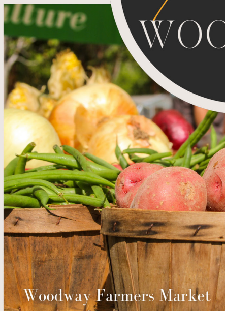
Woodway Farmers Market