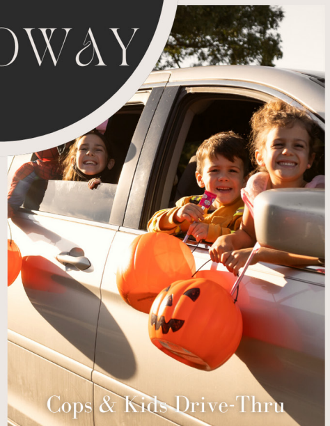
Cops & Kids Drive-Thru